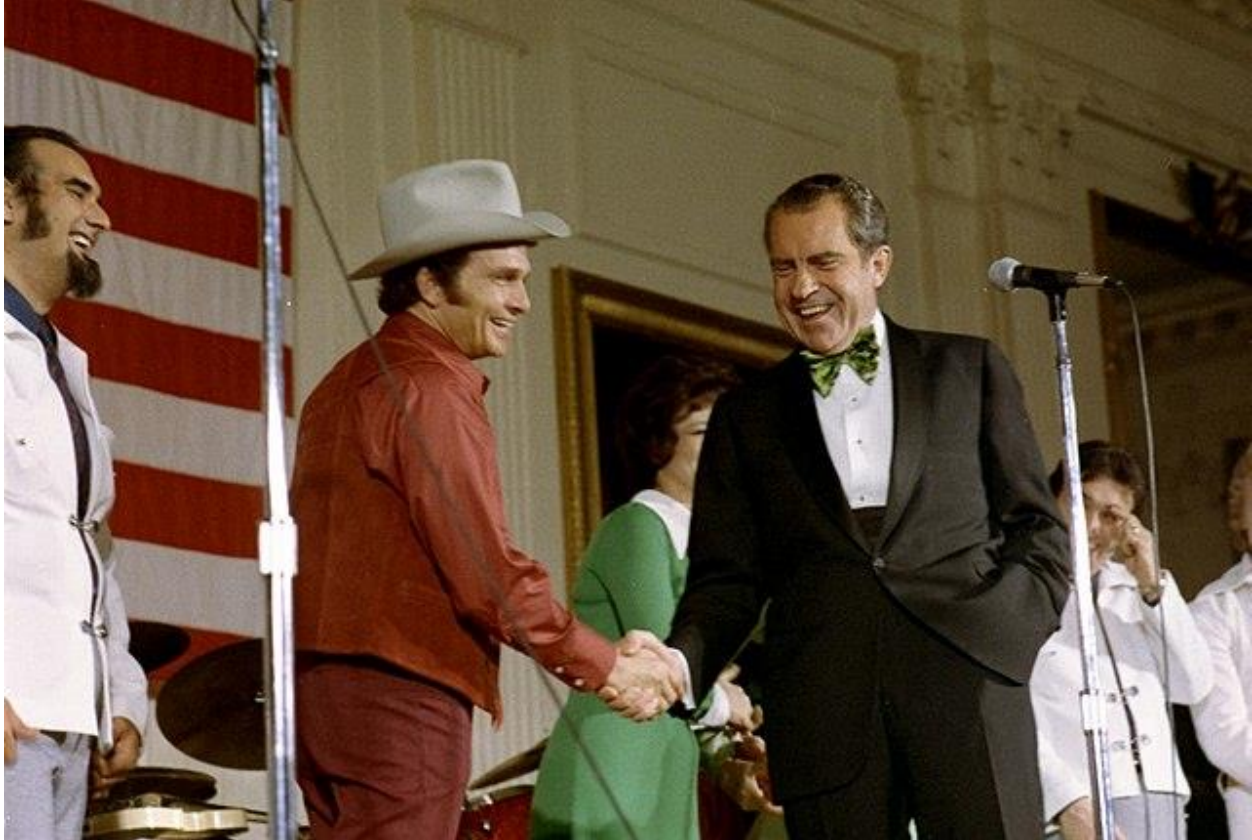
Figure 1 Richard Nixon and Merle Haggard at the White House, 1973.